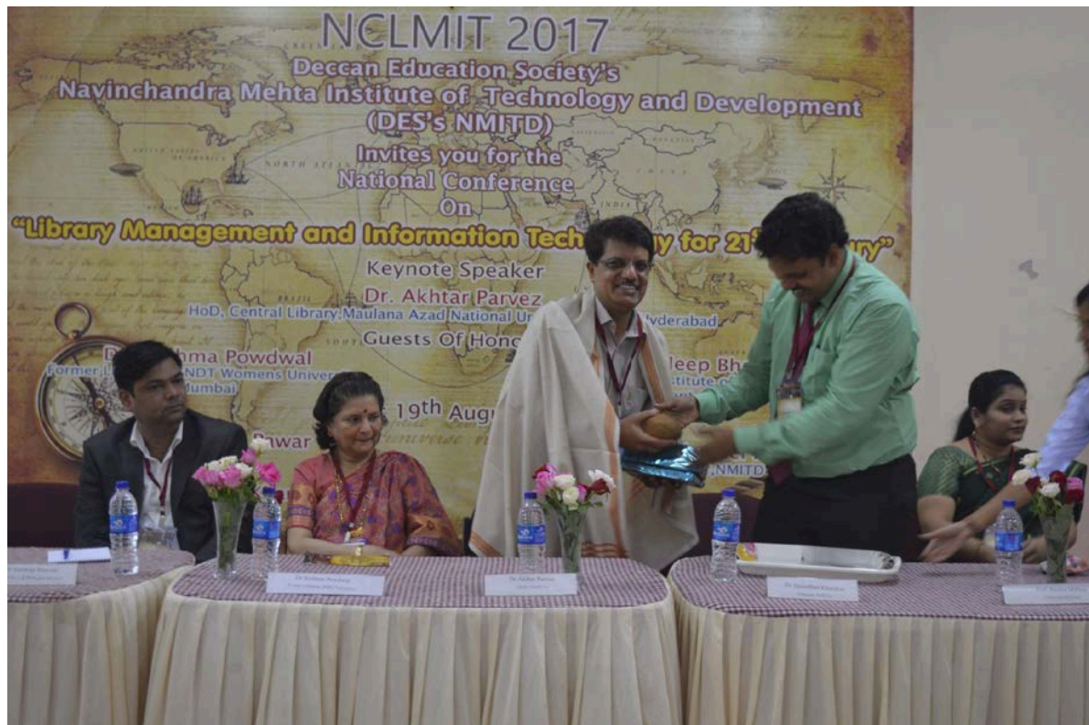
Felicitations of the Dignitary at “NCLMIT 2017”

Positive oral feedback was received by the participants of the conference on the proceedings and the conduct of the conference.