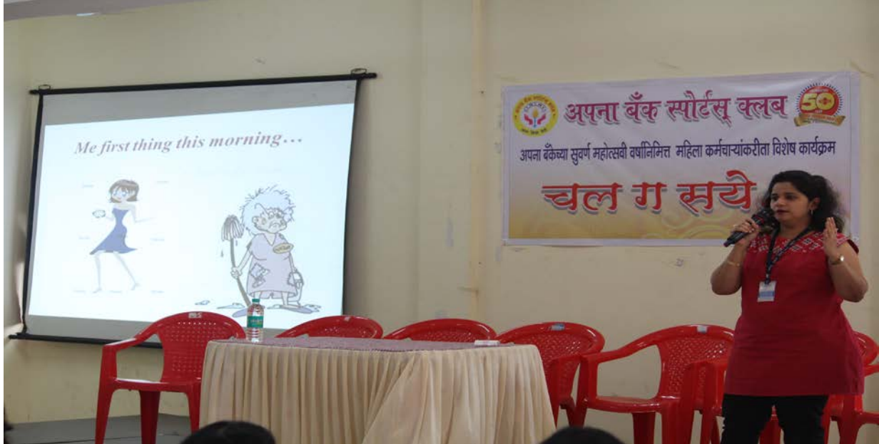
Session on “Work Life Balance” for APNA Sahakari Bank Ltd female employees