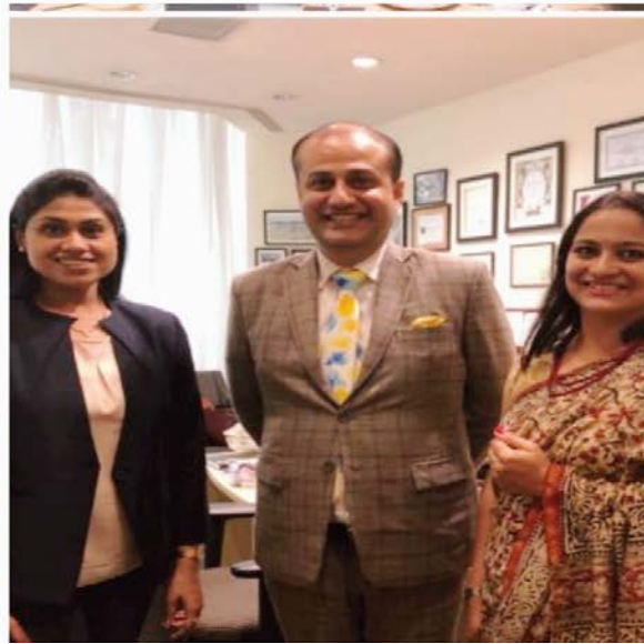
Glimpses of Workshop on “Self Management Through NLP and Emotional Intelligence”