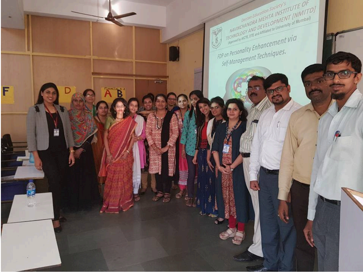
Workshop on "Personality Enhancement via Self-Management Techniques"