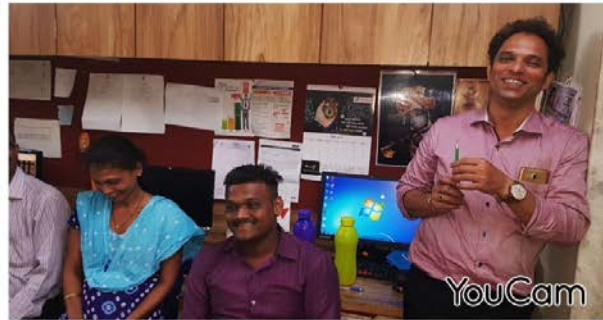
Glimpses of the Workshop on “Self Enhancement through Art & Science of First Impressions and Emotional Intelligence”