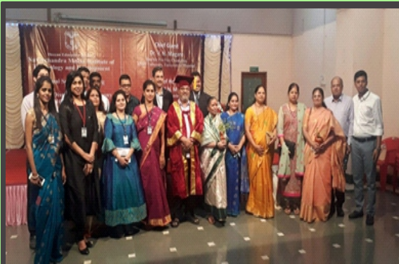
SEVENTH CONVOCATION CEREMONY OF DES NMITD