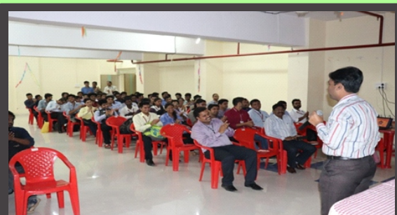
Jagrut Nagrik: A Seminar on being An Alert Citizen by Mumbai Police

Teachers are Mental Health Soldiers. Teachers act as a Mentor, coach, guide, parent, philosopher for the students and to be successful in all these roles. It's essential to emotionally connect with the students. This requires emotional self-appraisal of the teachers themselves. This FDP focuses on revitalizing this emotional connect with self and others by focusing on four components of Personality enhancement self-awareness, self-management, social awareness and relationship management. The take away of this FDP will be beautification of internal frame of mind which leads to reflection of confident and vibrant external personality. 22 Faculties from various B Schools and Other Colleges attended the programme.