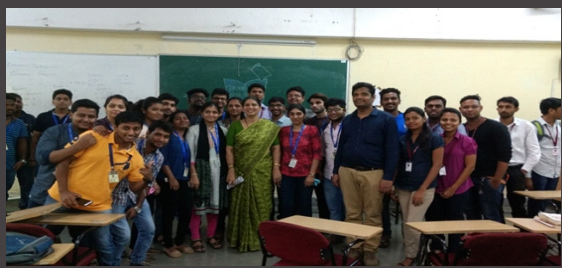
Vachak Prerana Din @ NMITD

With the number of road accidents in the state on the rise, Grahak Panchayat also collaborated with RTO and also had a road safety campaign. In 2017, there were 35,853 accidents reported in the state. A total of 12,264 people died in road accidents this year while 32128 were seriously injured. The state ranks third in terms of accidental deaths in the country. Students were shown various Road Signs and asked to identify the same. They also encouraged students for No Honking Campaign. It was a very educative workshop.