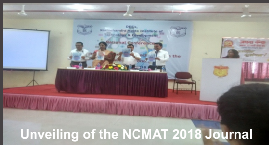
Unveiling of the NCMAT 2018 Journal