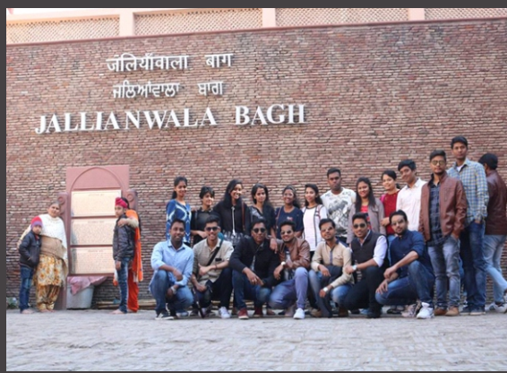
MERI DESH KI DHARTI---- Visit to Amritsar, Chandigarh 16th – 22nd January,2018

This Industrial visit organized to the above mentioned places, which inculcated patriotism, camaraderie, national integration and introduction to the green revolution and the rich farms of Punjab and the small and medium enterprises of Chandigarh. The students passed through 8 states namely Maharashtra, Gujrat, Madhya Pradesh, Rajasthan, Haryana, Delhi, Uttar Pradesh, and Himachal Pradesh. They saw the differences in the cuisine, culture and climatic conditions of all these states. The first stop was Chandigarh, where the students visited Havells Industry. They also learnt the difference in business practices in western and northern India. The following day was spent by visit to 2 gardens – Rock Garden and Sukna Lake. Next on the itinerary was Amritsar. The evening was spent at Shimmering Golden Temple and students enjoyed the evening view which was similar to the Vatican City streets. Next day, we went to Jalian Bagh and its museum and the Wagha Border where the students witnessed the Retreat Ceremony followed by. Students enjoyed the famous Amritsari Kulcha and Lassi. Overall an educative tour refreshing the minds of the students. Overall an educative tour refreshing the minds of the students.