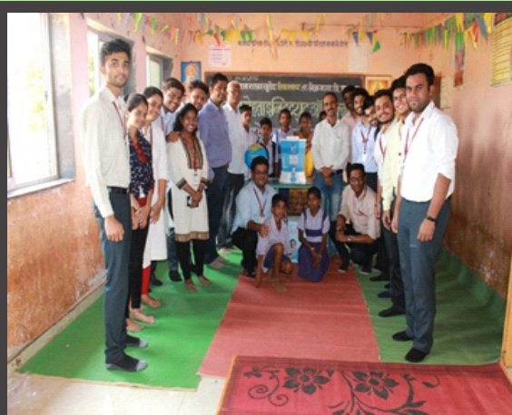
Farewell – MCA / MMS 2018