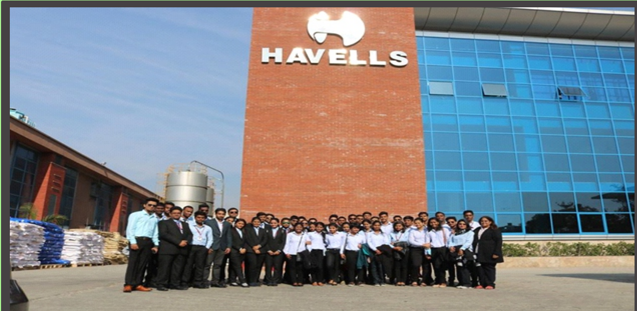
Industrial Visit to Punjab of MMS/MCA Students