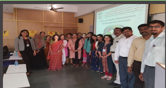
FDP on Personality Enhancement via Self-Management Techniques

This Industrial visit organized to the above mentioned places, which inculcated patriotism, camaraderie, national integration and introduction to the green revolution and the rich farms of Punjab and the small and medium enterprises of Chandigarh. The students passed through 8 states namely Maharashtra, Gujrat, Madhya Pradesh, Rajasthan, Haryana, Delhi, Uttar Pradesh, and Himachal Pradesh. They saw the differences in the cuisine, culture and climatic conditions of all these states. The first stop was Chandigarh, where the students visited Havells Industry. They also learnt the difference in business practices in western and northern India. The following day was spent by visit to 2 gardens – Rock Garden and Sukna Lake. Next on the itinerary was Amritsar. The evening was spent at Shimmering Golden Temple and students enjoyed the evening view which was similar to the Vatican City streets. Next day, we went to Jalian Bagh and its museum and the Wagha Border where the students witnessed the Retreat Ceremony followed by. Students enjoyed the famous Amritsari Kulcha and Lassi. Overall an educative tour refreshing the minds of the students. Overall an educative tour refreshing the minds of the students.