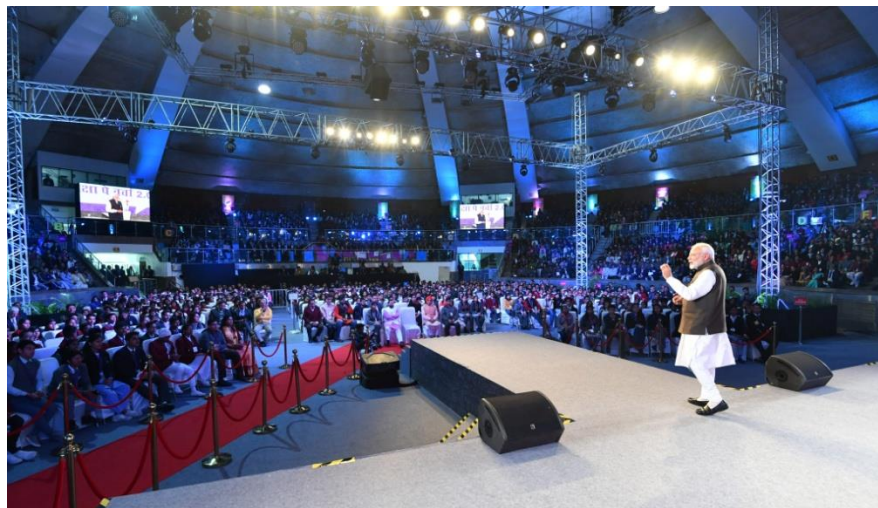
Tag: PM Narendra Modi addressing the youth and parents