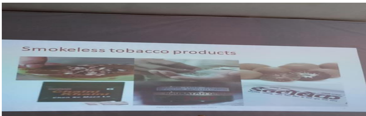
Fig 3: New smokeless tobacco products for attracting youths