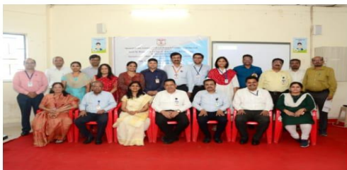
Organization Committee of "National Symposium on Intellectual Property Rights: Prerequisite in Higher Education and Research"