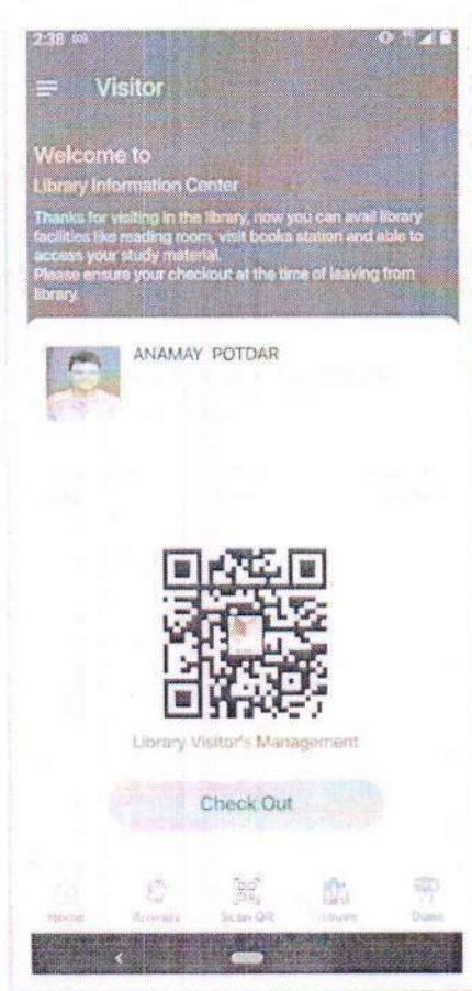
Anamay Potdar (C23091)