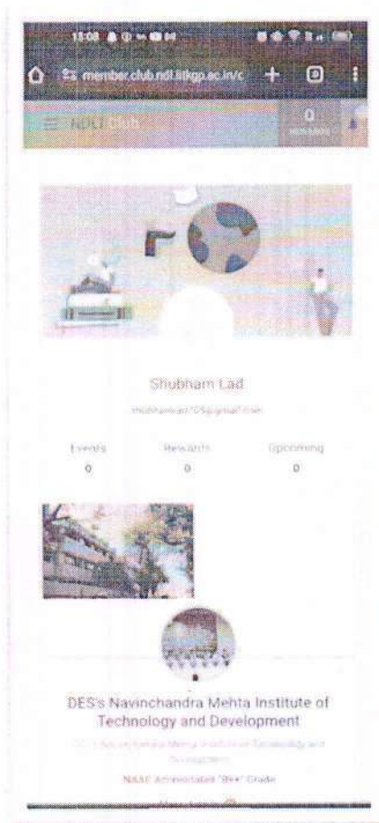
Shubham Lad (M14134)