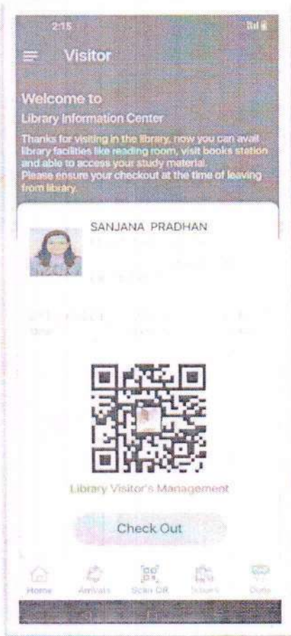
Sanjana Pradhan (C23092)